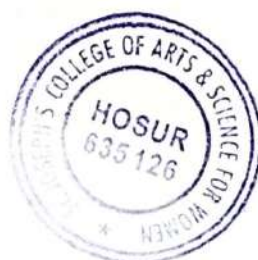
Signature of the Principal

PRINCIPAL ST. JOSEPH'S COLLEGE OF ARTS & SCIENCE FOR WOMEN Mookandapalli, Sip HOSUR - 635 126, Krishna