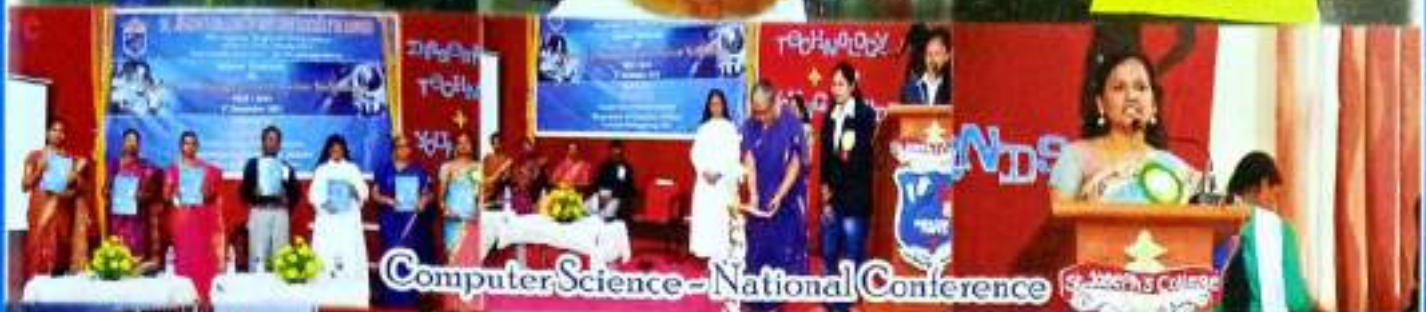
Computer Science - National Conference