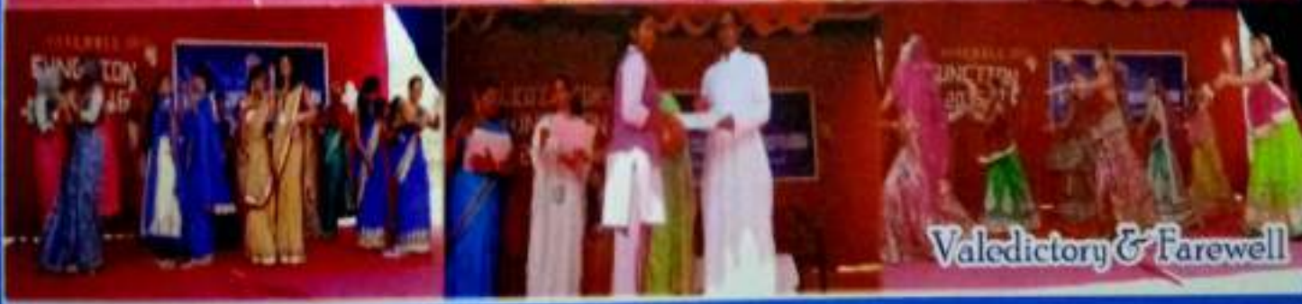
Valedictory & Farewell