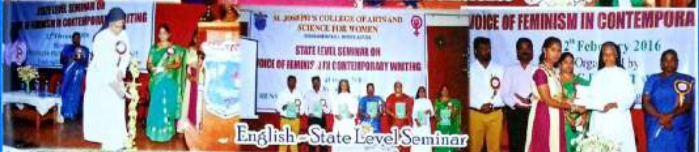
English - State Level Seminar