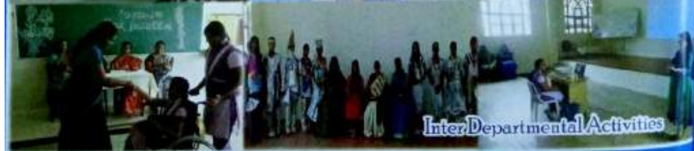
Inter Departmental Activities