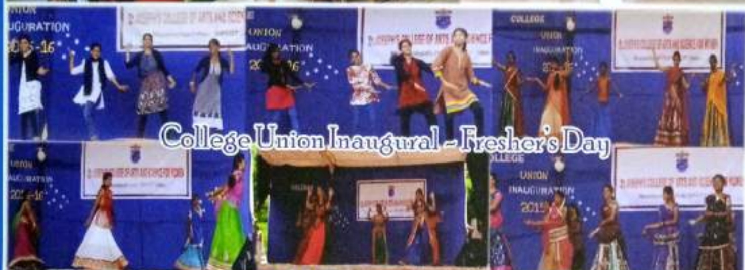
College Union Inaugural - Fresher's Day